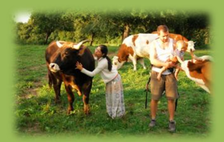
We made it! and we arrived well to the new home in Einborn (Thüringen).