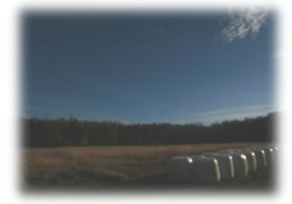
For the reason that we can not produce our food (for the cows) until next year, we had to order 28 grass silo balls. Furthermore, to facilitate that the grass in the fields grow nicely next year (and

The winter food arrived after that it was brought by a firma from the neighbors' town.