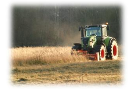
And then it was everything ready: unfortunately there are

"movable", because we are not allowed to build any fix building for the animal or the cows (construction rules that nobody understand).